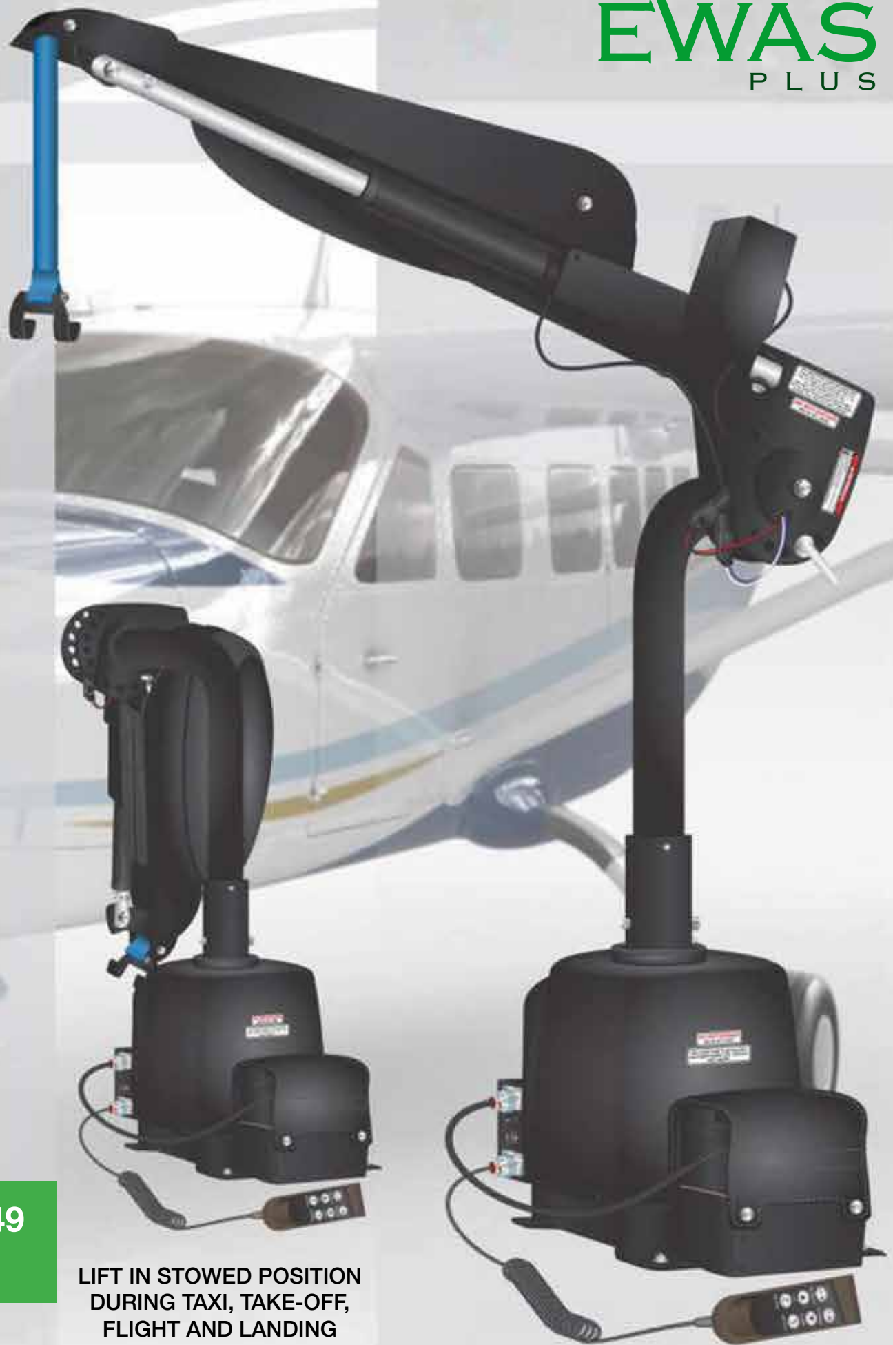
LIFT IN STOWED POSITION DURING TAXI, TAKE-OFF, FLIGHT AND LANDING

CONTACT : 208.863.8208 | 239.280.6949 FOR PRICING AND DELIVERY INFORMATION